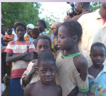
These boys are waiting in line for oral hygiene training and dental care product distributions.

These women experience a life engulfed by hardship that drives infant mortality to second highest in the world. The leadership of Women to the World understands this, and offers proven, sustainable developmental solutions to poverty that include agriculture, animal care, and water conservation. Our Country Director's office reports overwhelming enthusiasm and commitments from these village women to the training received.